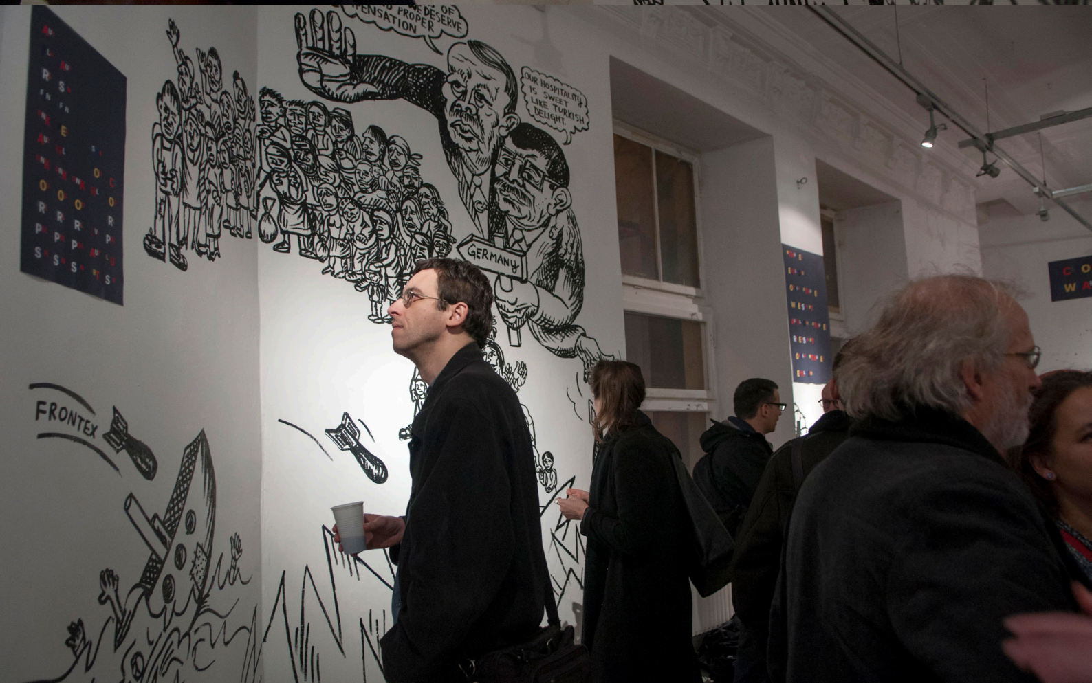
Cold Wall, exhibition opening.