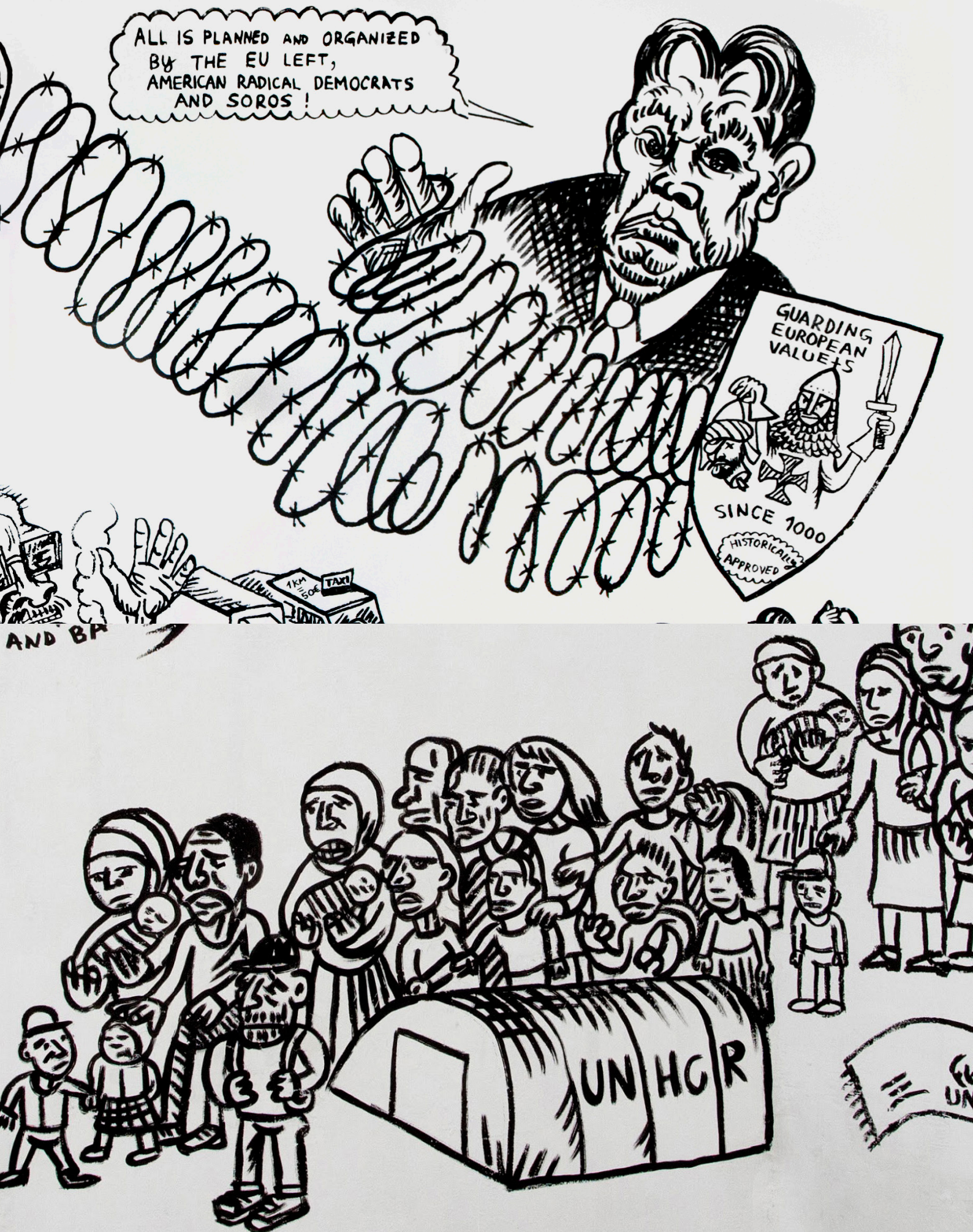
Cold Wall. Detail of Vladan Jeremić's contribution.