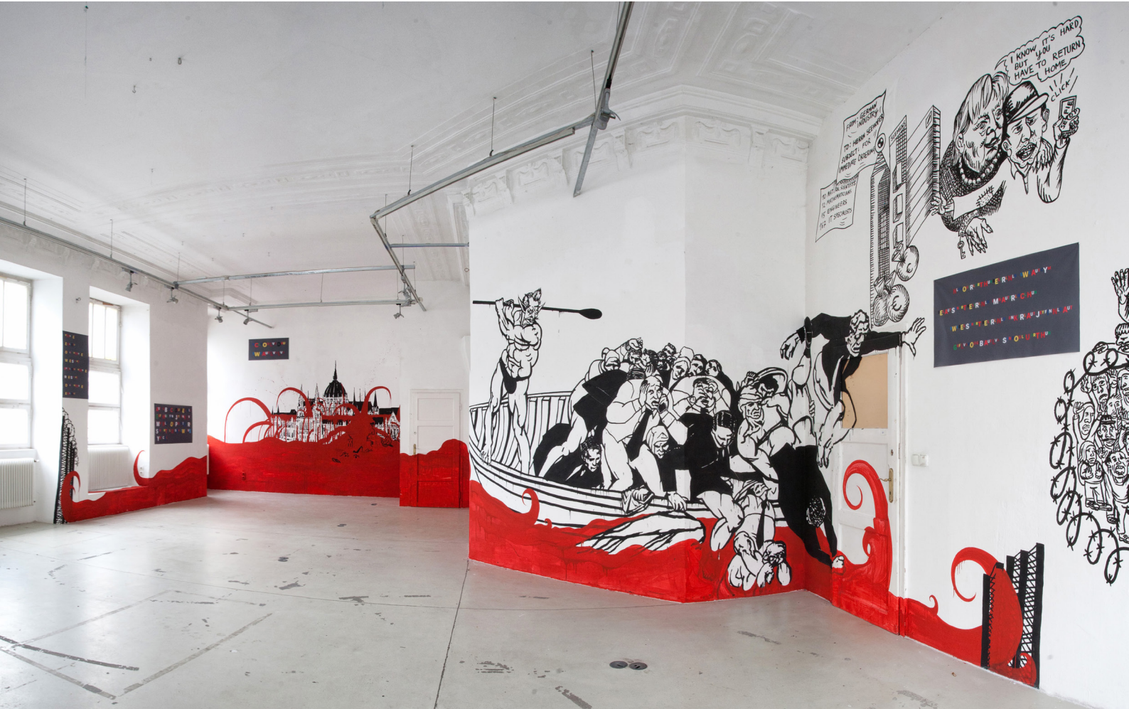
Exhibition view Cold Wall , Studio of Young Artists' Gallery, Budapest, November 2015.