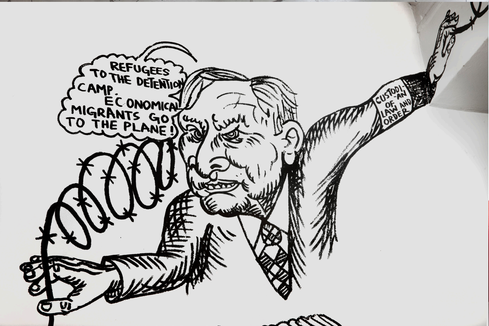
Cold Wall . Detail of Vladan Jeremić's contribution.

Taking as a starting point the 175 kilometres long barbed wire fence first built on the border between Hungary and Serbia – and expanding since then to Croatia and Slovenia – the project attempts to broaden and open up the discourse in order to give a glimpse of the forest behind the tree, and this from three different perspectives and formal approaches. Ferenc Gróf's contribution will be a typographic work focussing on the concept of "Fortress Europe" with references to Frontex, an agency established in 2004 to