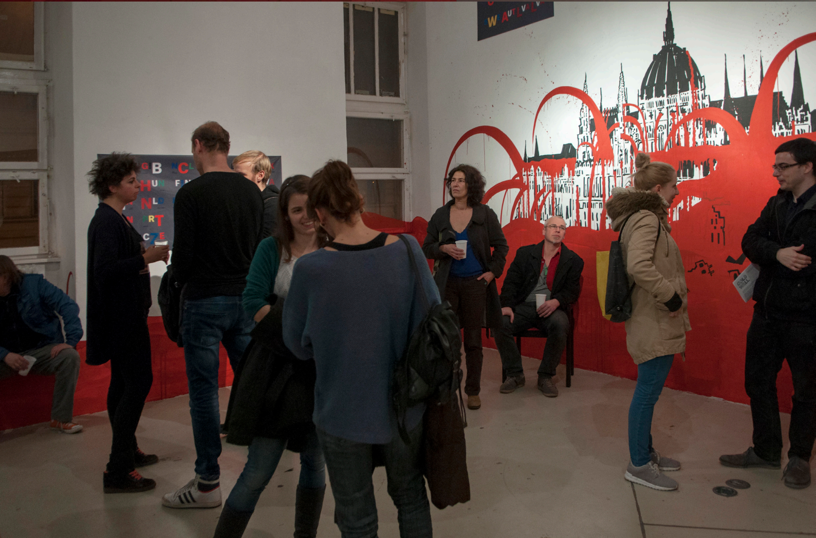
Cold Wall, exhibition opening.