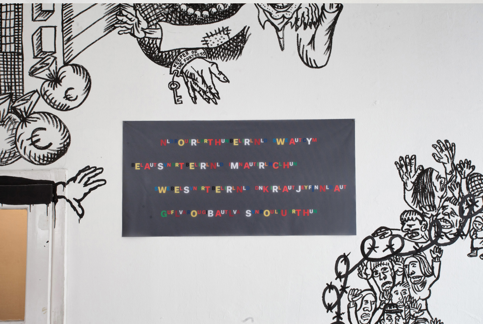
Cold Wall. Detail of Ferenc Gróf's contribution.