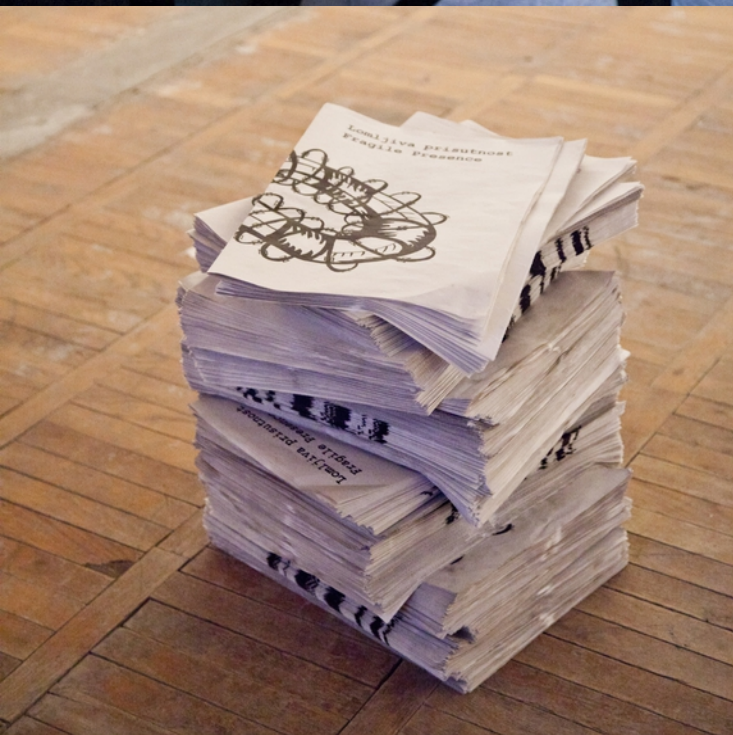
Guided tour and printed edition Fragile Presence, October Salon 2016