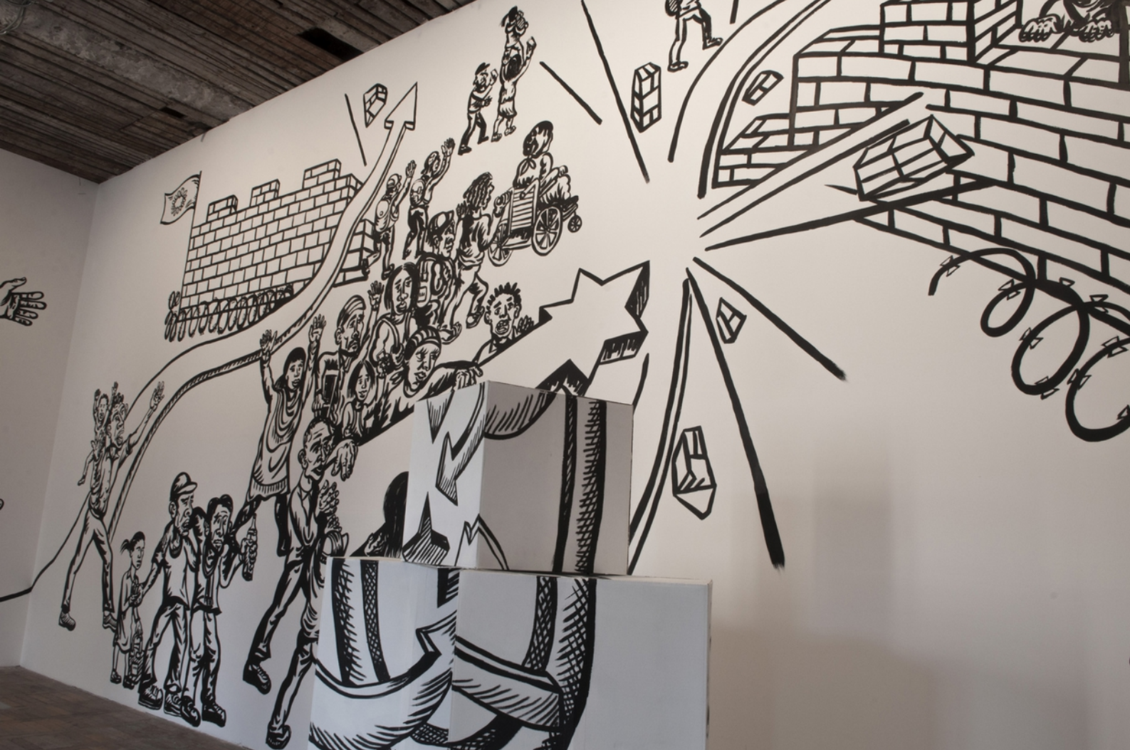
Fragile Presence, exhibition view, City Museum Belgrade, 56 th October Salon, 2016.