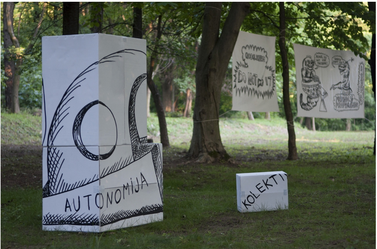
Observations from the Edge. Temporary „objects-ideas“, banners Non-Googleheim.