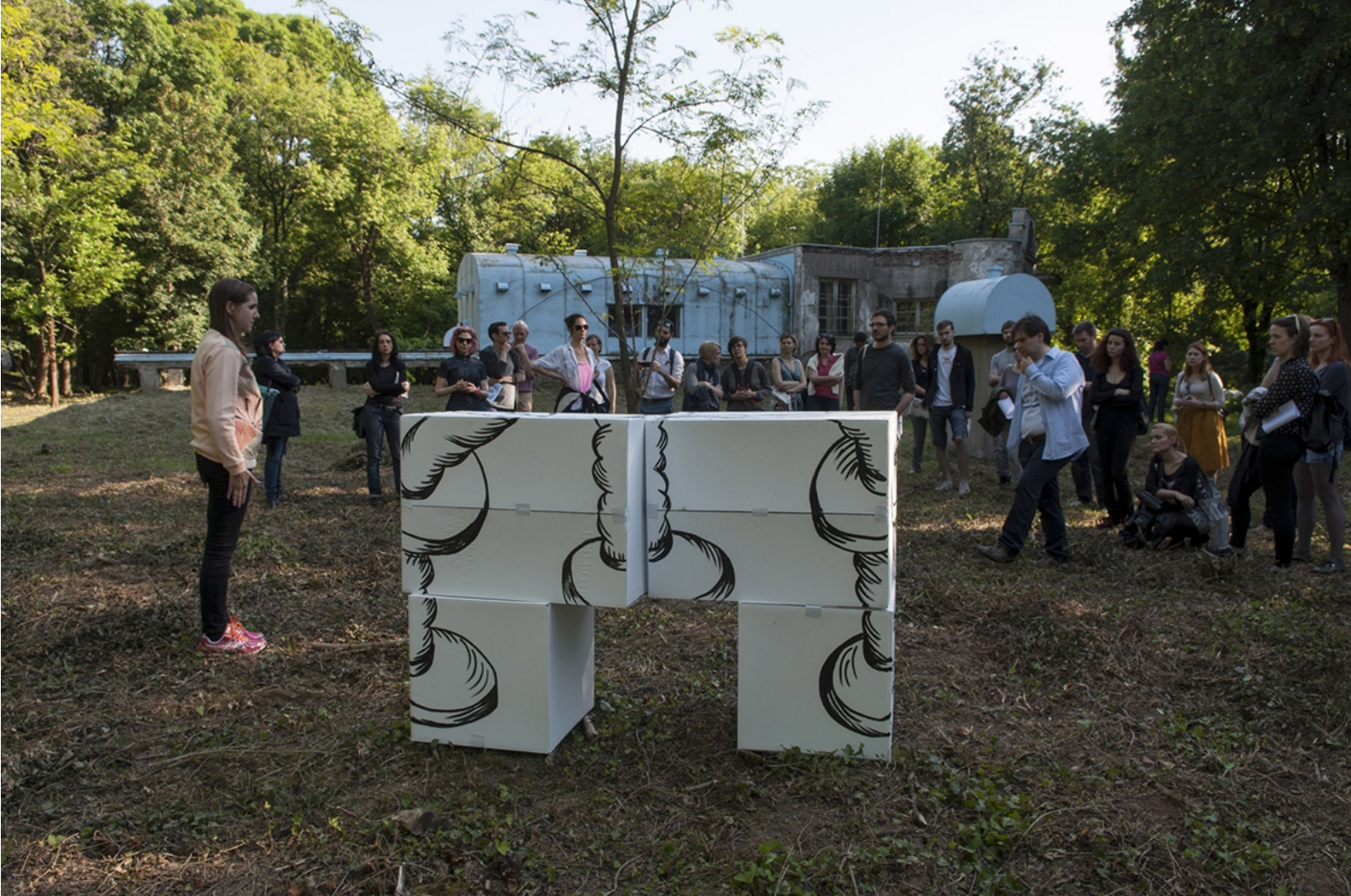
Observations from the edge , introduction and discussion of the object-idea Decentering temporarily installed at the Astronomic Observatory, Belgrade, 2016.