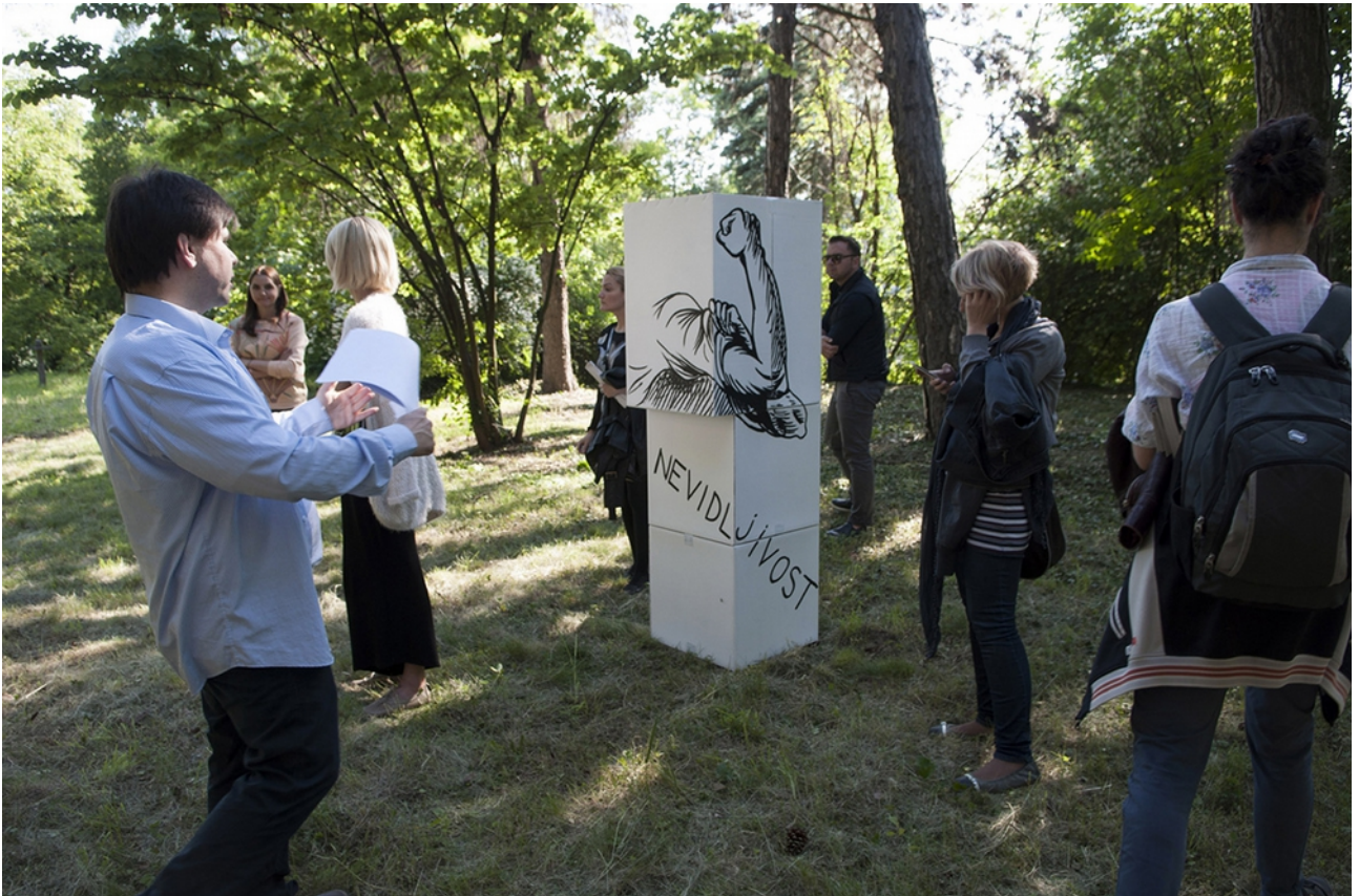
Observations from the Edge. Discussion about the „objects-ideas“ and their relation to the Observatory.