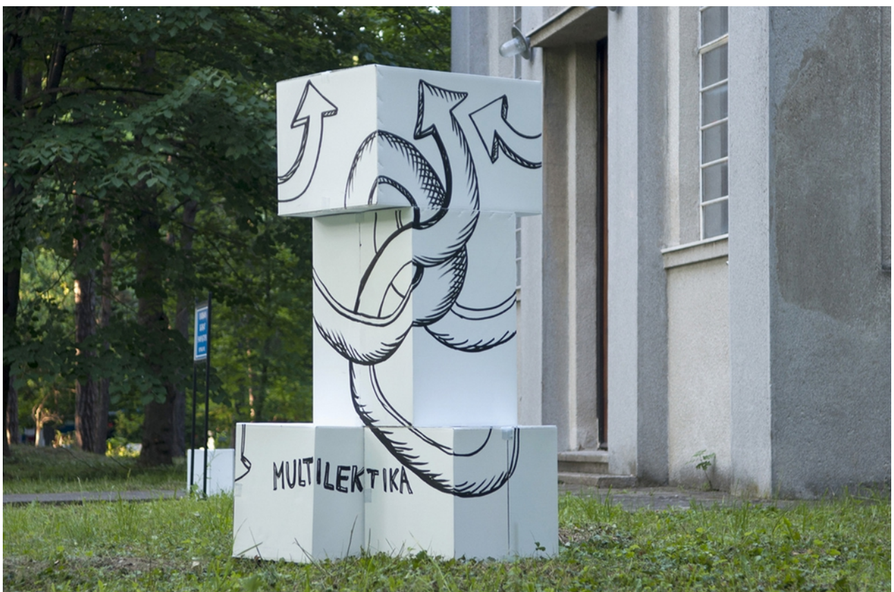
Observations from the Edge. Temporary object in front of one of the pavilions.