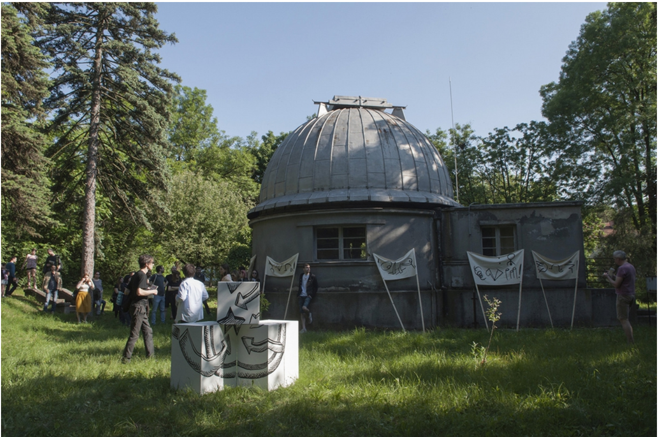
Observations from the Edge. Temporary „objects-ideas“ with pavilion of Belgrade Observatory.