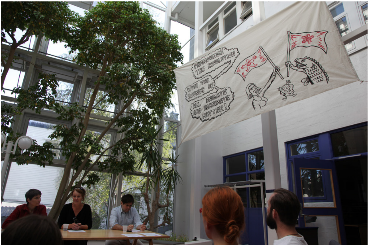
Red Winter , banners and public discussion about the artistic action at the Levanger townhall.