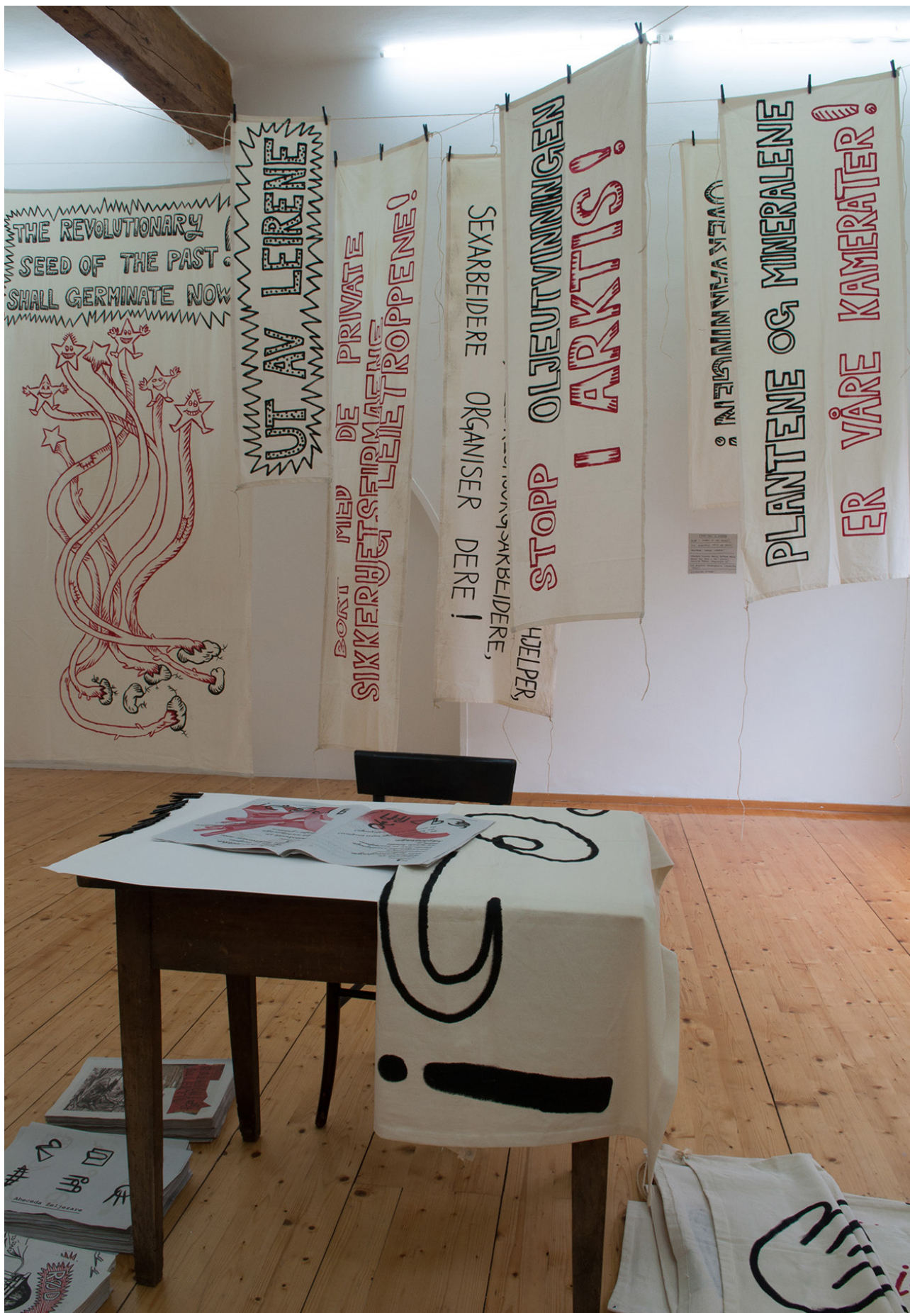
Installation view of Red Winter banners at Gallery SIZ, Rijeka, 2015.