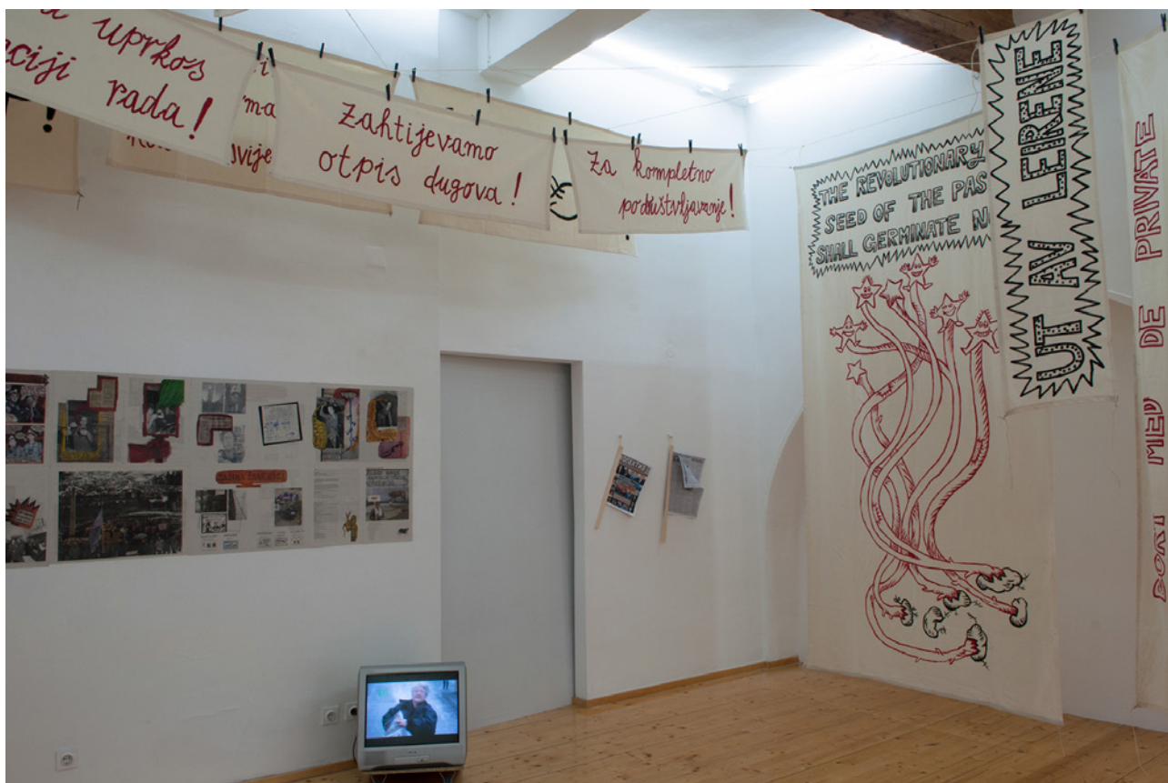
Installation views of Red Winter banners and Red Winter newspaper at Gallery SIZ, Rijeka, 2015.