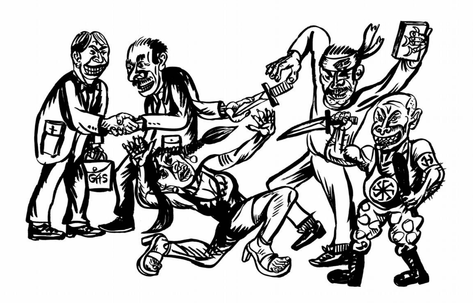
Drawing from worksheet no. 2: "The Deal"