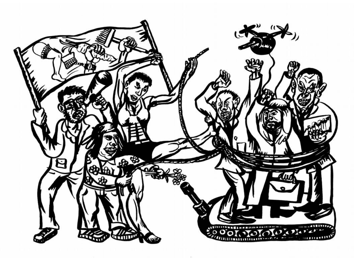
Drawing from worksheet no. 5: "The Precariat"