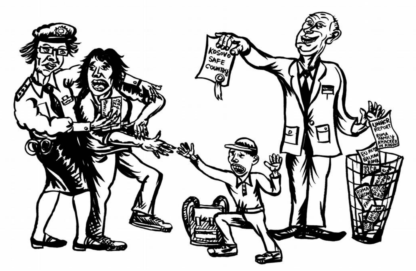
Drawing from worksheet no. 3: "The Safe Country"