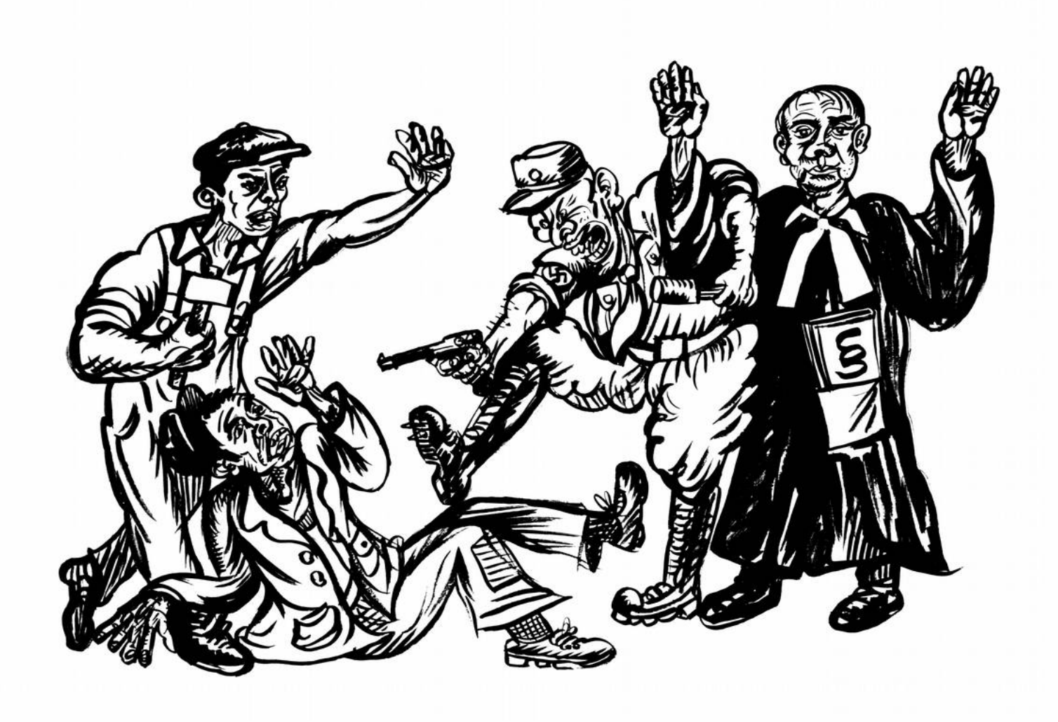
Drawing of the intervention by communist activists at the NSDAP gathering January 13 1930 in Emden.