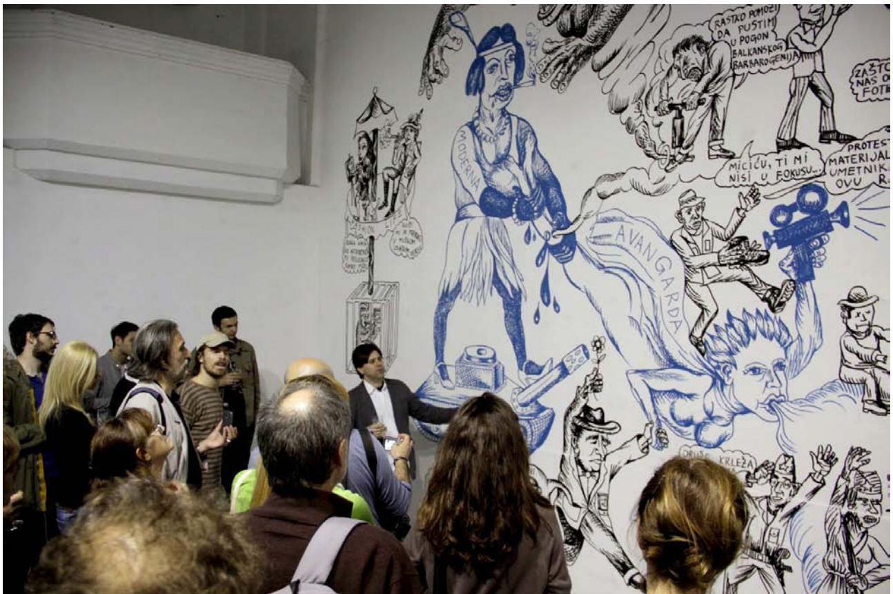
Public talk related to the artwork