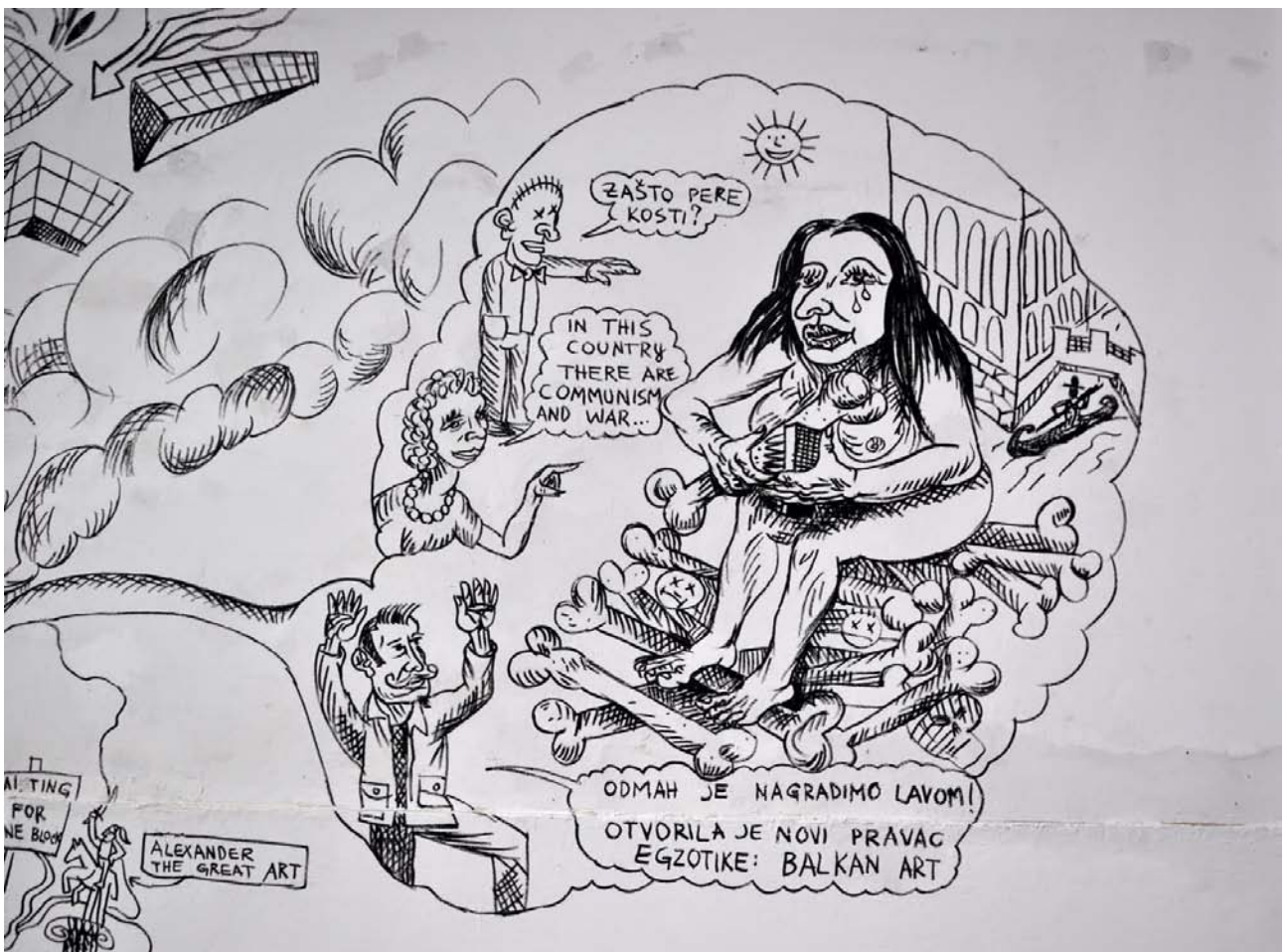
A detail: Representation of Marina Abramovic work „Balkan Baroque“ in Venice