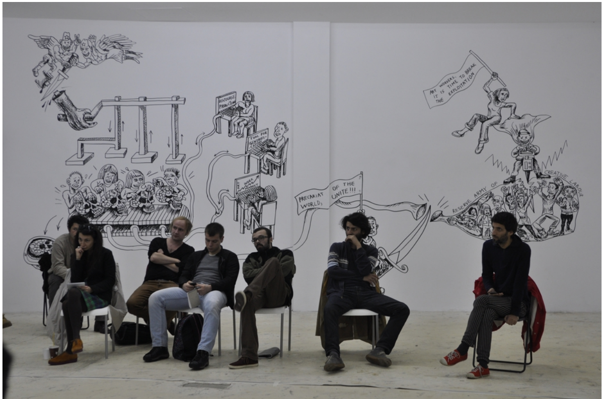
Didactical drawing The production cycle, Parasites and Prophets , Transit, Bucarest, 2013.