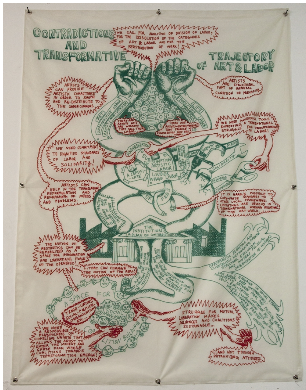
Didactical drawing, digital print of the drawing on textile, exhibition view at 10 godina Magacin, Belgrade, 2017.