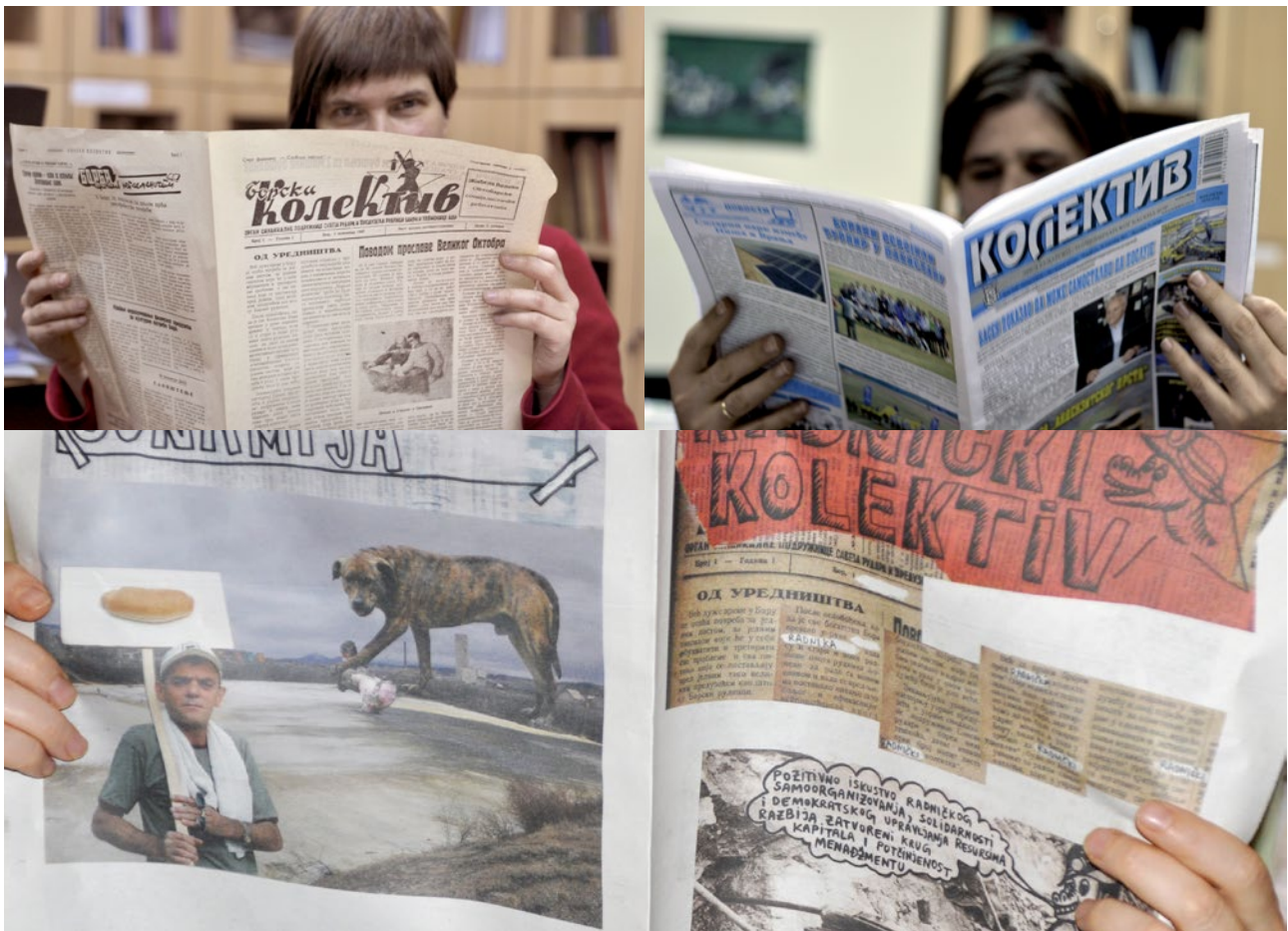
Bor Collective , issue from 1947 and issue from 2012. Special edition Workers' Collective , 16 pages. Rena Rädle and Vladan Jeremić in collaboration with Saša Lović, Bor 2013

Texts cut out from the original newspapers are updated striking through and replacing certain words, old political slogans are contrasted with new ones. A collage of historical and contemporary practices of workers' self-organization is printed on a double page. It shows photos of the election of the workers' councils after the socialization of the mine and images of the mass protests during the last decade, when many branches of the mining company entered the privatization process and stopped production.