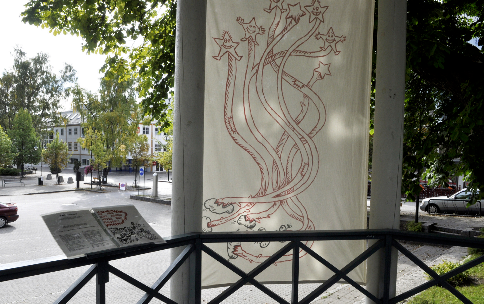
View of Red Winter intervention with sound installation and banners at the main square of Levanger, 2014