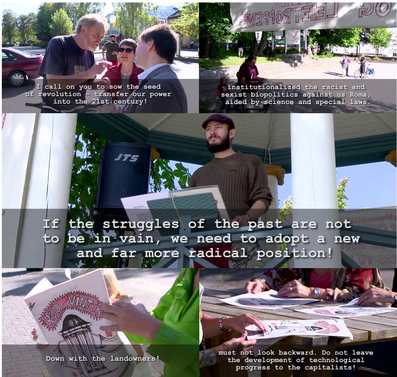
Distribution of the newspaper on the main square of Levanger.

Stills from the video Red Winter , 16 min, editing: Rena Rädle, camera: echomedia, Levanger, Norway, 2014