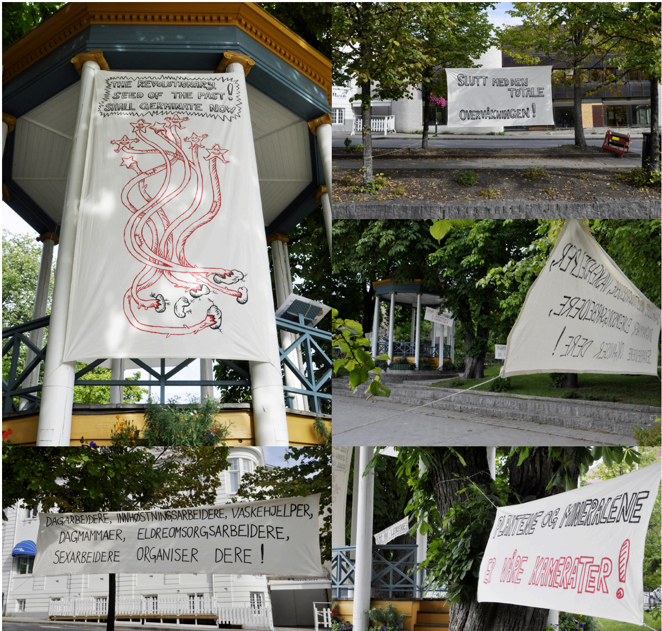
Red Winter. Banners at the pavillion and around the Levanger town square.

The work Red Winter* draws on a local tradition of historical folk theater. However, the aim of the intervention reaches beyond a re-enactment of historical events. The imaginary interaction between the speeches and slogans that are each derived from specific situations and political conjunctions, draws a connection ranging all the way from the past to the social struggles of today.