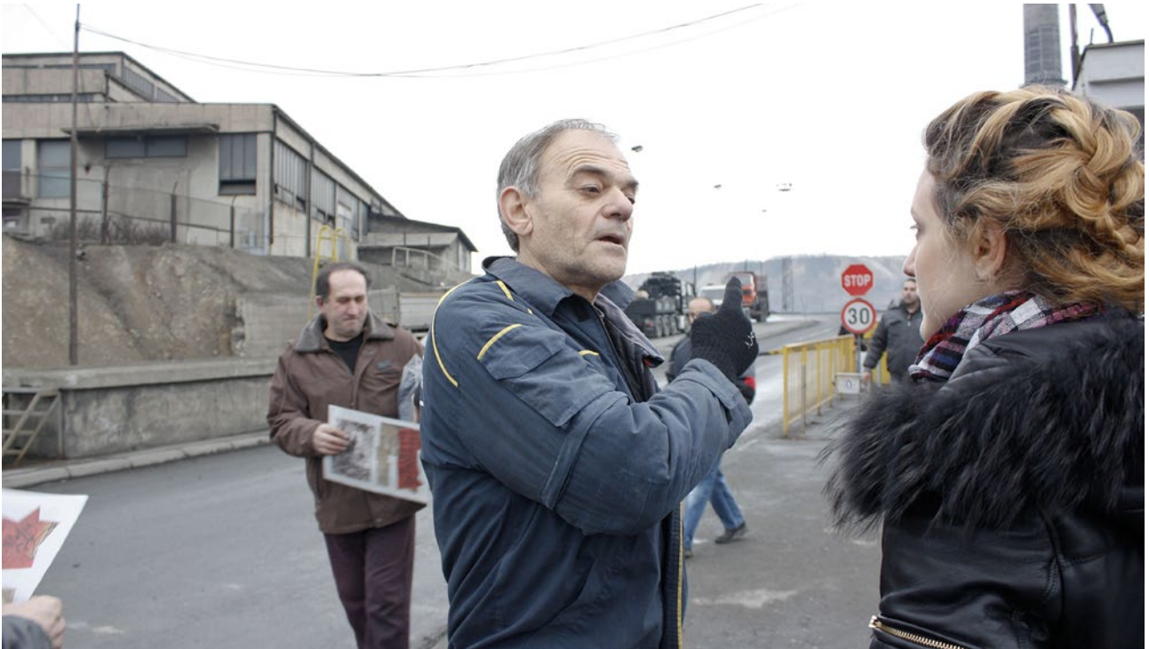
Still from the video Workers' Collective