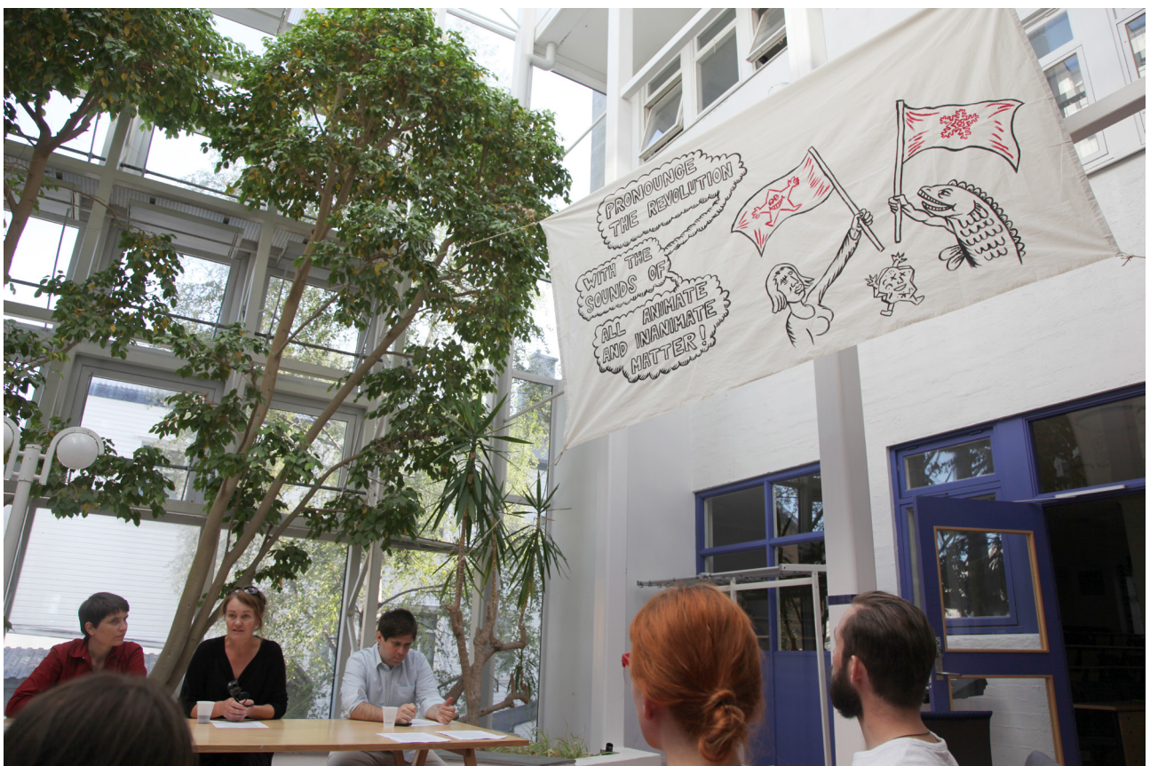
Public discussion about the artistic action at the townhall of Levanger.