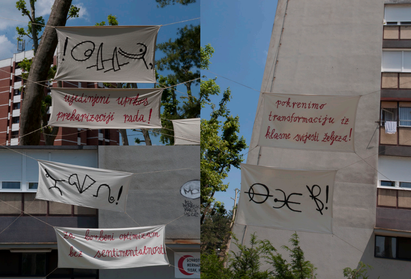
Ironworks ABC. Transparents at the central square of the Ironworks district Željezara.

Ironworks ABC deals with the language of social transformation, which references the recent past of collective work between workers and artists. It is conceived as a kind of alphabet for thinking work as liberated practice and struggle for creation. Ironworks ABC is composed of banners in the public space, intended for the neighborhood of Caprag, and text-based graphics pages in the form of newspapers, in which matter itself appeals to us: iron ore, pipes, sheets, steel, and sculptures.