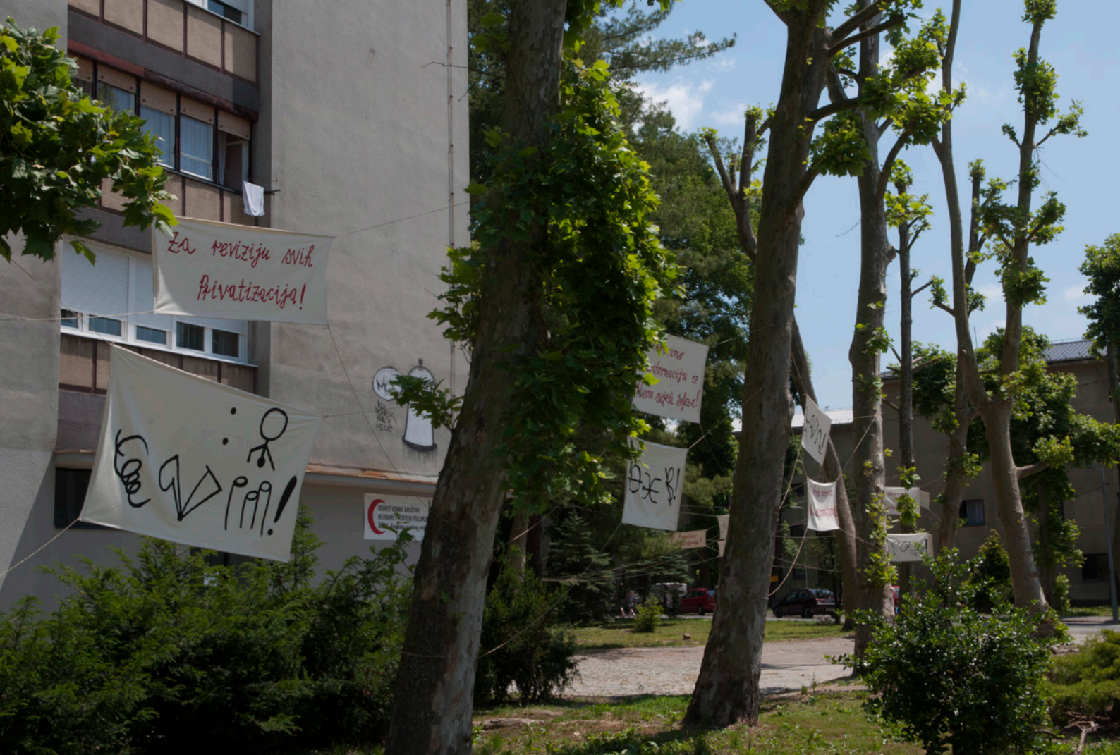
Ironworks ABC. Transparents at the central square of the Željezara district of Sisak.