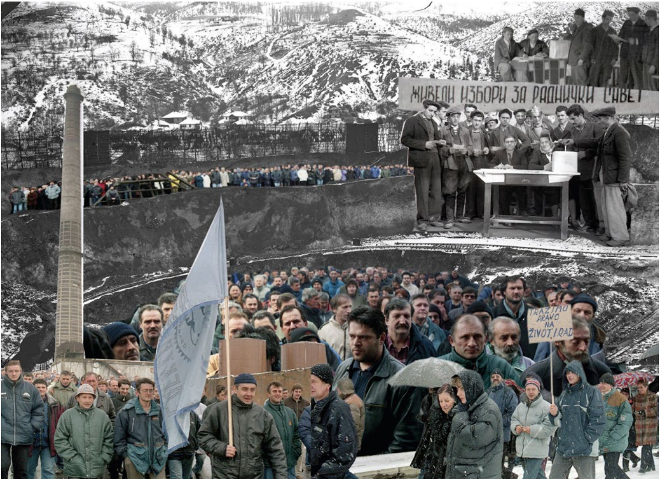
Photomontage, double-page from Workers' Collective

Almost thousand newspapers were distributed to the workers in front of the copper mines' gate during shift change. They were invited to the discussion at the People's Library of Bor the same evening. The discussion centred amongst others on the fact that the so called democratisation of the society did not lead to an increase but to the total loss of workers' control in the management of their factories. Another problem that was raised was the corruption of the big trade-unions by the political establishment that controls the privatisation process and the reform of workers' rights legislation.