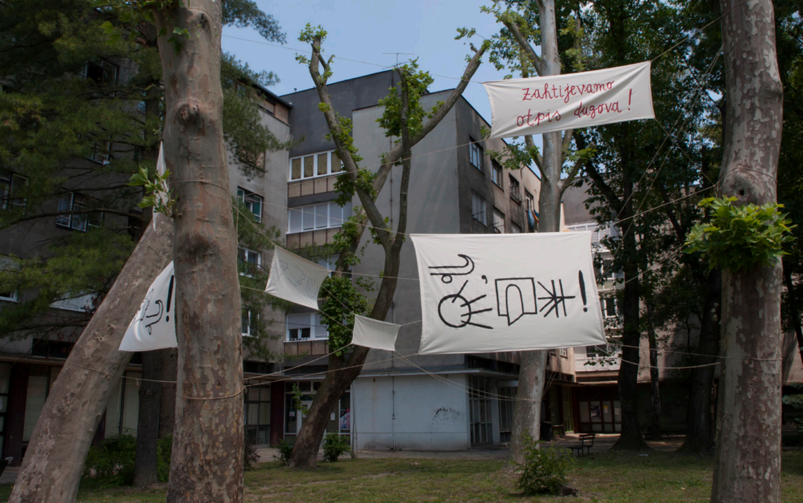
View of Ironworks ABC . Intervention with transparents at the main square of the Ironworks district Željezara, Sisak 2015.