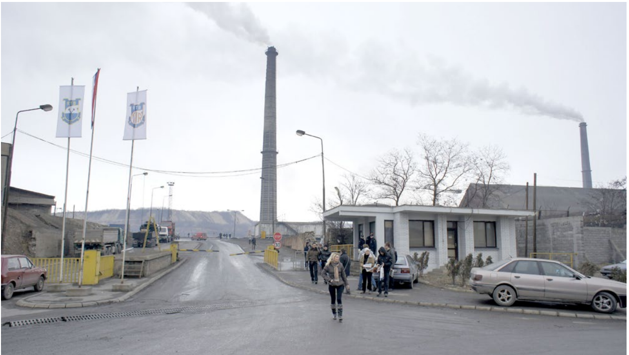
Video still: Distribution of Workers' Collective