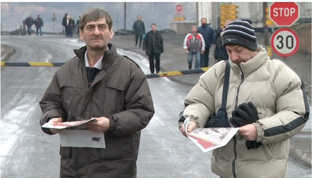
Video still: Distribution of Workers' Collective