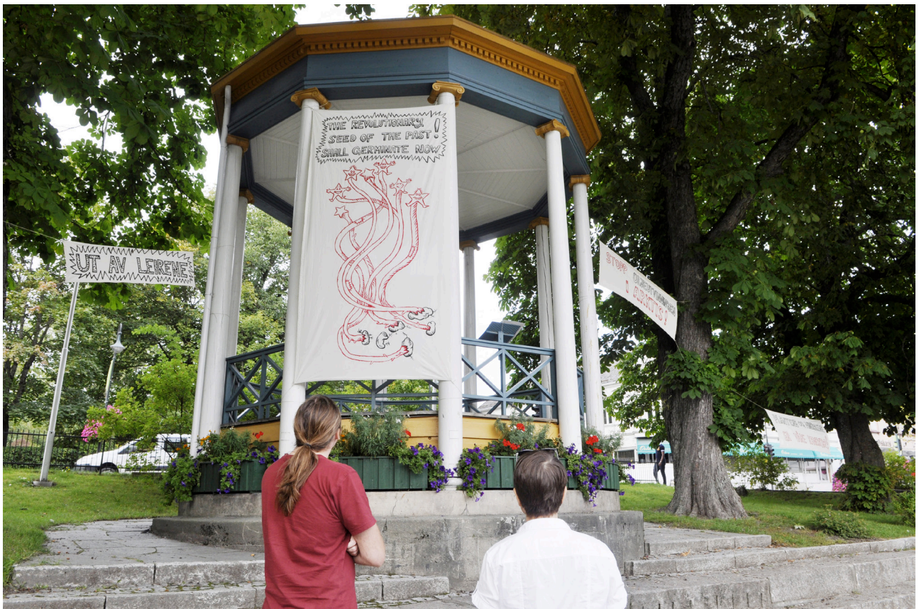
Pavillion with sound installation, newspaper and banners.