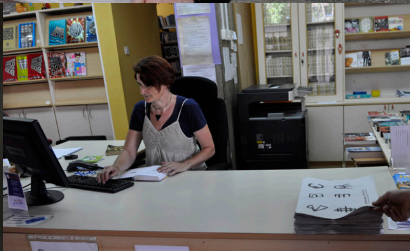
Distribution of the newspaper in Željezara , the Ironworks district of Sisak.