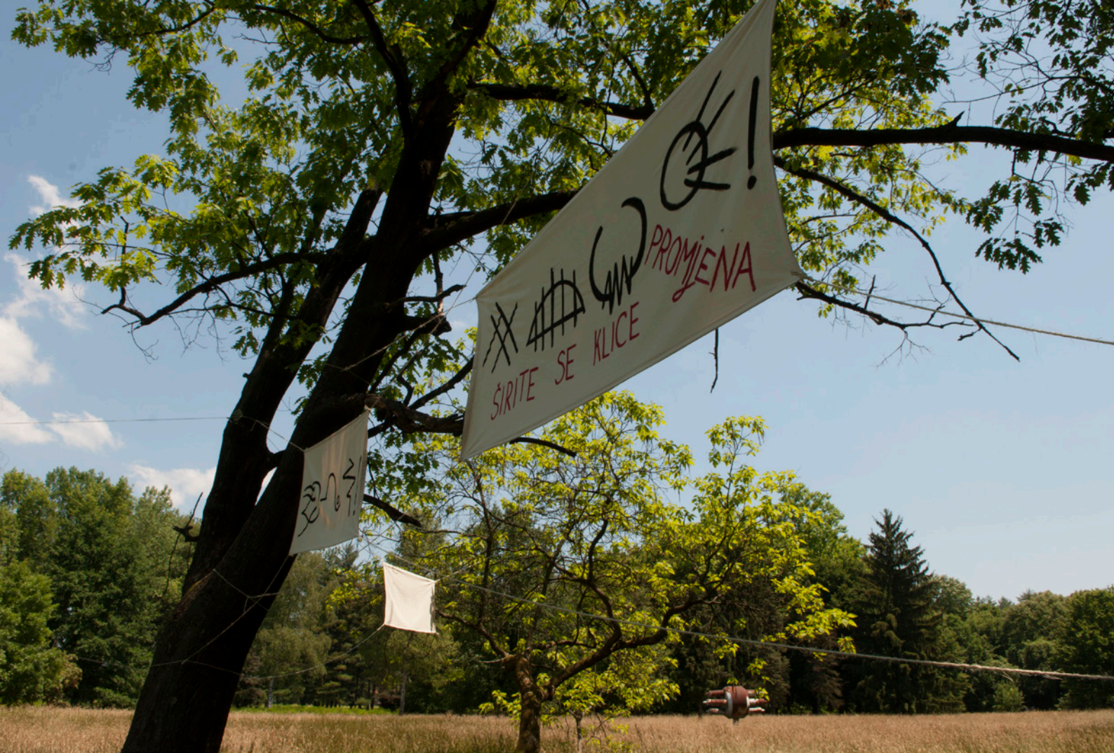
Ironworks ABC. Transparents at the city park of the Ironworks district.