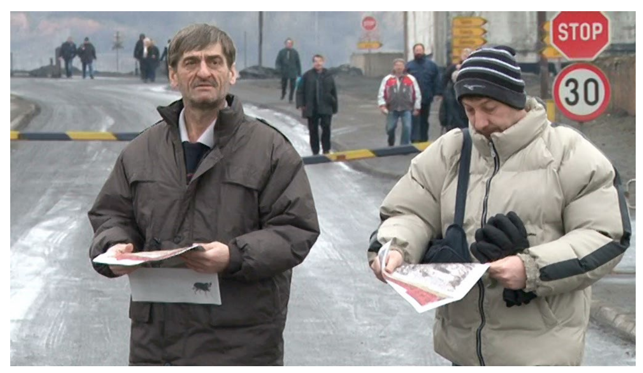
Video still: Distribution of Workers' Collective