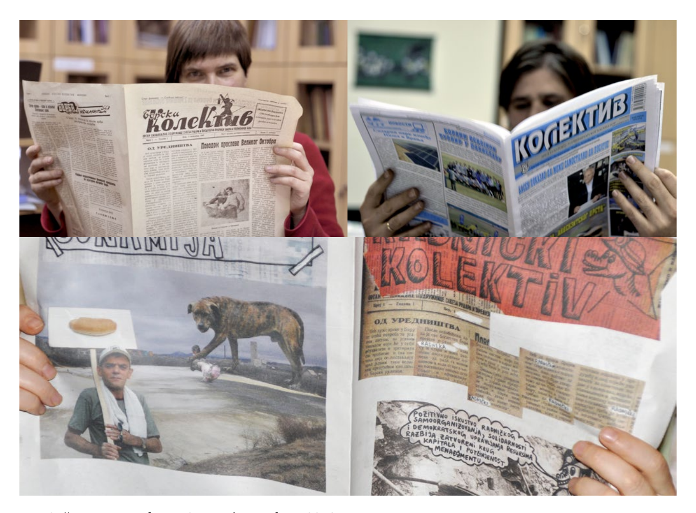
Bor Collective, issue from 1947 and issue from 2012. Special edition Workers' Collective, 16 pages. Rena Rädle and Vladan Jeremić in collaboration with Saša Lović, Bor 2013

Texts cut out from the original newspapers are updated striking trough and replacing certain words, old political slogans are contrasted with new ones. A collage of historical and contemporary practices of workers' self-organization is printed on a double page. It shows photos of the election of the workers' councils after the socialization of the mine and images of the mass protests during the last decade, when many branches of the mining company entered the privatization process and stopped production.