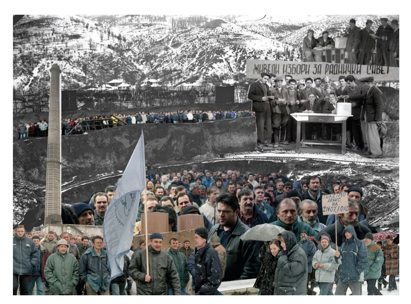
Photomontage, double-page from Workers' Collective

Almost thousand newspapers were distributed to the workers in front of the copper mines' gate during shift change. They were invited to the discussion at the People's Library of Bor the same evening. The discussion centred amongst others on the fact that the so called democratisation of the society did not lead to an increase but to the total loss of workers' control in the management of their factories. Another problem that was raised was the corruption of the big trade-unions by the political establishment that controls the privatisation process and the reform of workers' rights legislation.