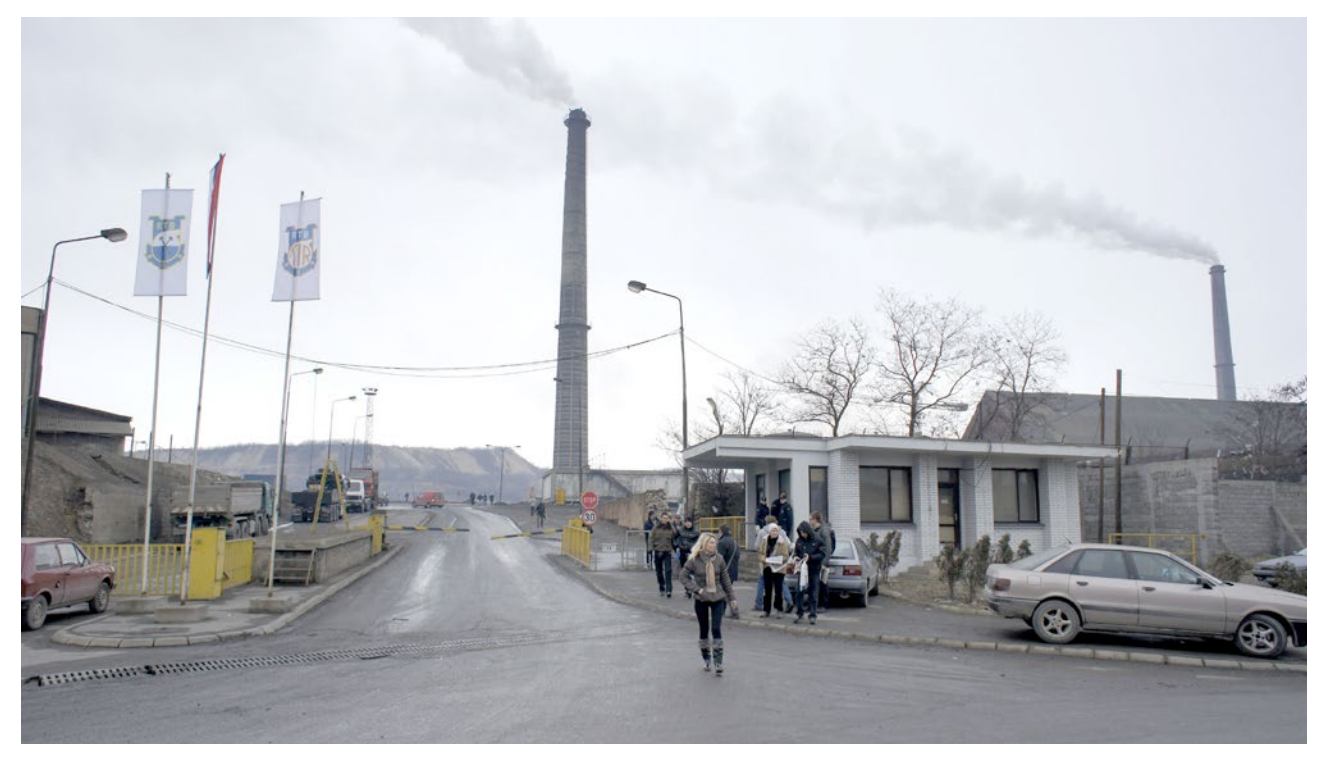
Video still: Distribution of Workers' Collective