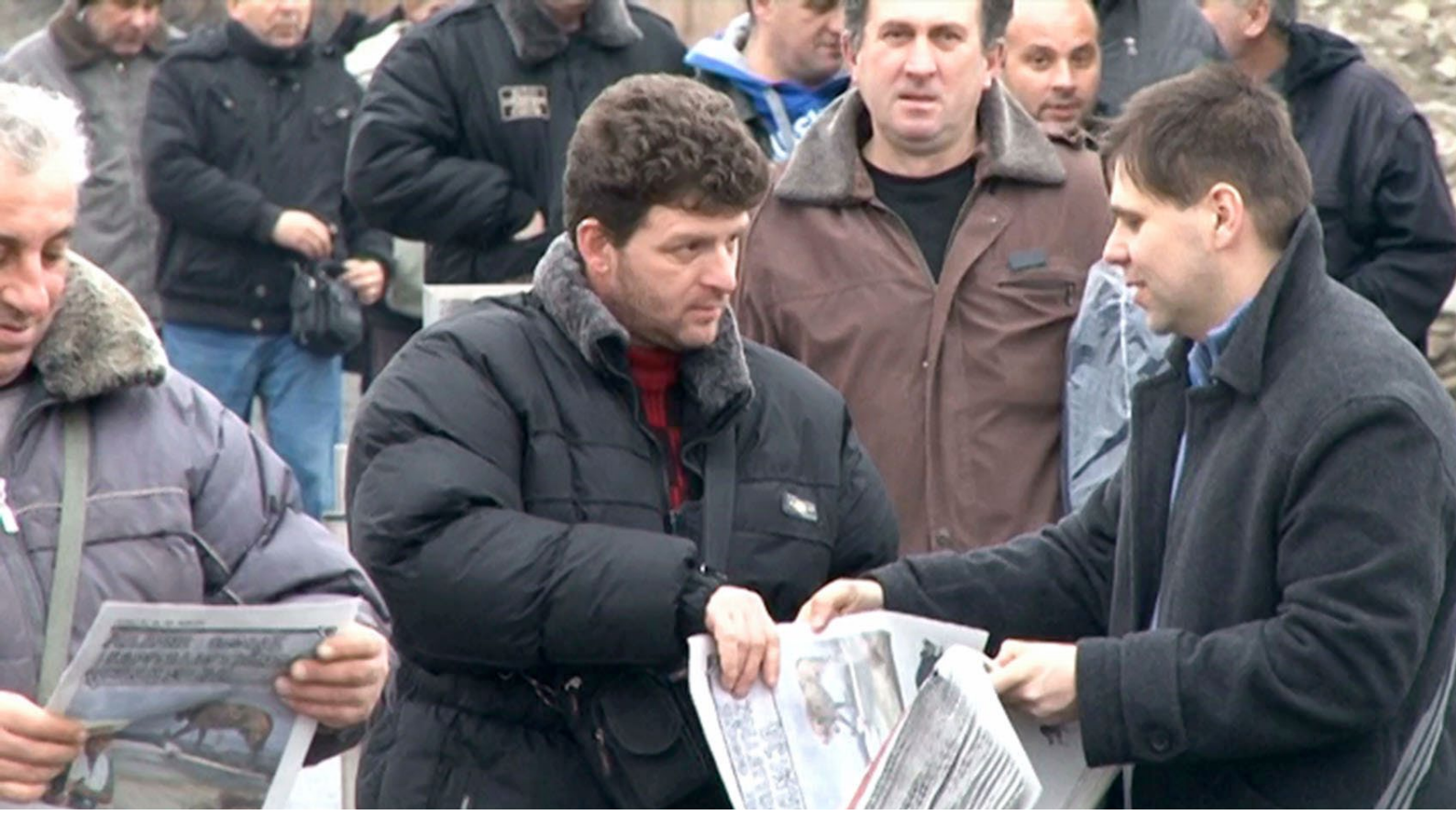
Still from the video Workers' Collective. Distribution of the newspaper in front of the main gate of the Mining and Smelting Basin of Bor (RTB). 5 min, editing: Rena Rädle, camera: Rastko Popov, Bor 2013