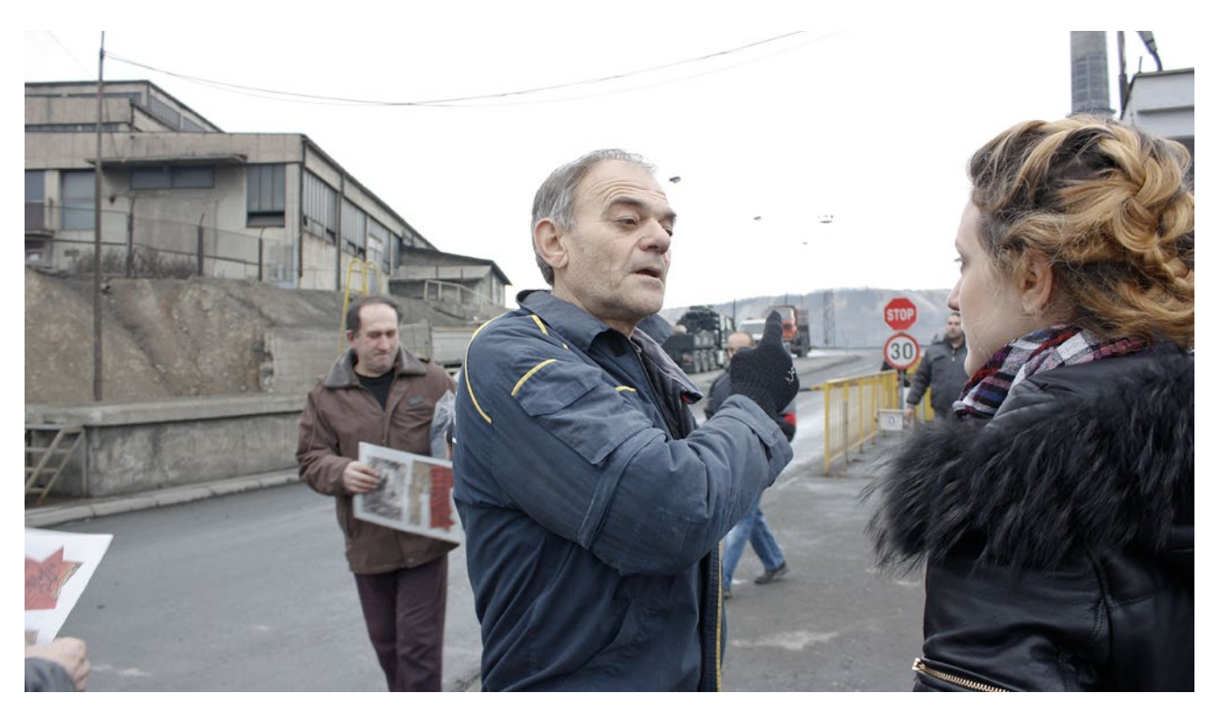
Still from the video Workers' Collective